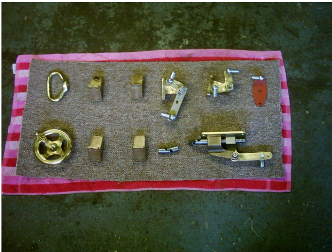
Traditional engine control installation kit.